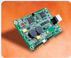
2500U USB controller board