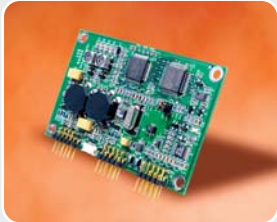
2500S serial controller board